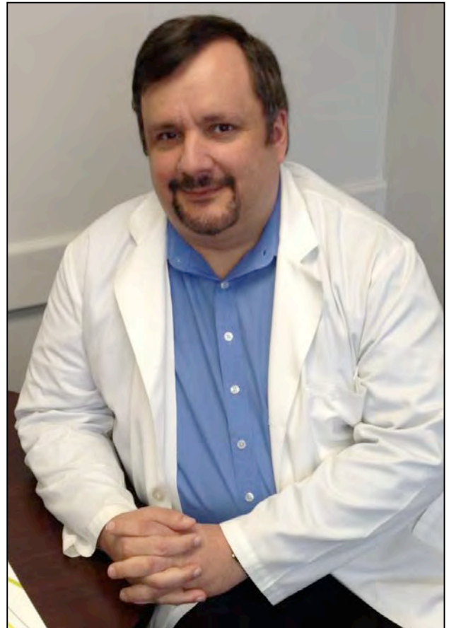
2013; Volume 46, Issue 1