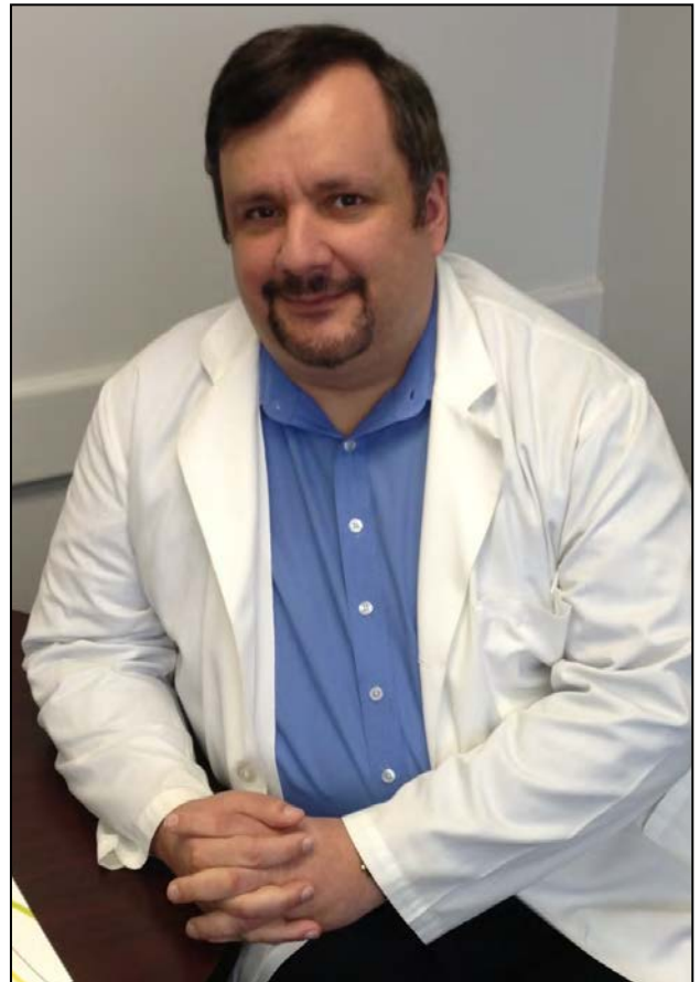
2013; Volume 46, Issue 2